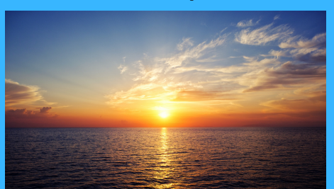
Pancakes @6:40 on the practice field Sunrise @ 7:04