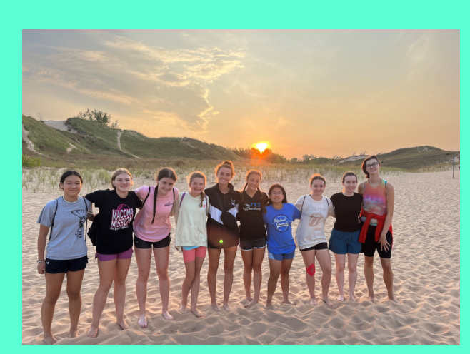
GREAT MORNING FOR A CROSS COUNTRY RUN